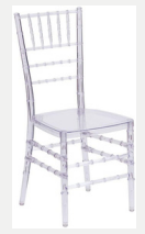
CLEAR CHIAVARI CHAIR