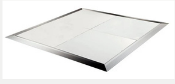
WHITE DANCE FLOOR