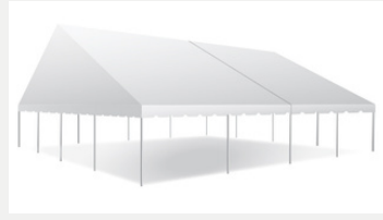
CLEAR GABLE END TENT