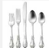
VANESSA SILVER FLATWARE