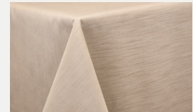
IVORY MAJESTIC LINENS