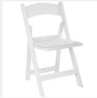
WHITE RESIN FOLDING CHAIR