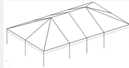
WHITE VINYL FRAME TENT