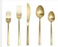
BRUSHED GOLD FLATWARE