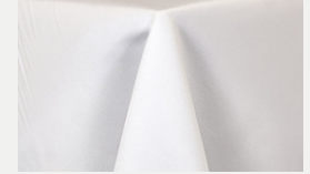
WHITE MATTE SATIN LINENS