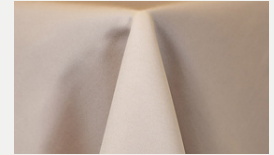
CAMEL MATTE SATIN NAPKIN