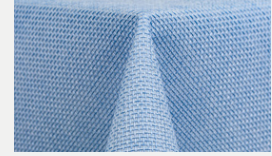
CAROLINA BLUE RATTAN LINENS