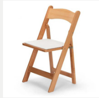
NATURAL FOLDING CHAIR