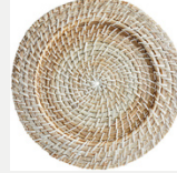
WHITEWASHED RATTAN CHARGER