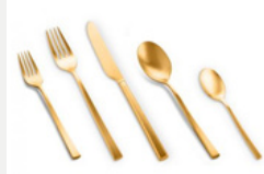
BRUSHED GOLD FLATWARE