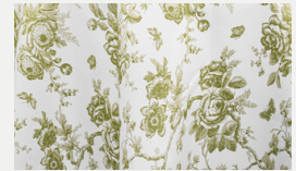
AVOCADO TOILE NAPKINS